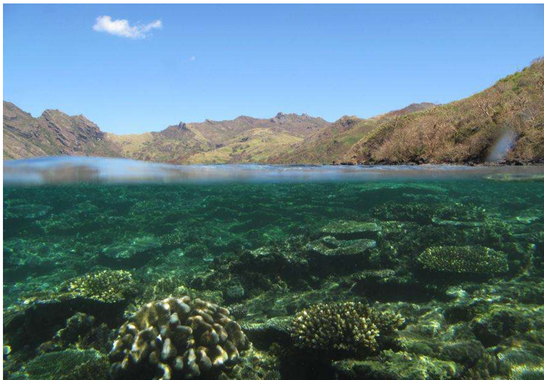
A ridge to reef seascape from Waya Island, Fji.

While most land is held under customary landownership, marine and freshwater tenure is vested in the State by virtue of the Crown/State Land Act [Cap 132] and the Rivers and Streams Act [Cap 136] . This is a contradiction to traditional customary law where traditional fishing grounds ‘iqoliqoli’ belonged to adjacent communities (see section 1.2 above).