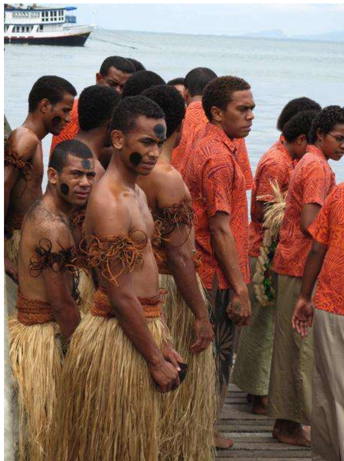
Fijian youth in traditional attire, Suva, Fiji.

Over the past two decades, several hundred coastal communities in Fiji have established locally managed marine areas (LMMAs) (Govan et al. 2009a; Mills et al. 2011) and share knowledge about best practice through the Fiji LMMA network (FLMMA). While the primary management tool applied within LMMAs has been customary fishing closures, communities are now scaling up management activities to include adjacent freshwater and terrestrial areas within clan, village or district tenure boundaries (Clarke and Jupiter 2010). There has been recent dialogue among stakeholders in Fiji to develop parallel learning networks to FLMMA to help communities share best practice for sustainable land management and climate change adaptation.